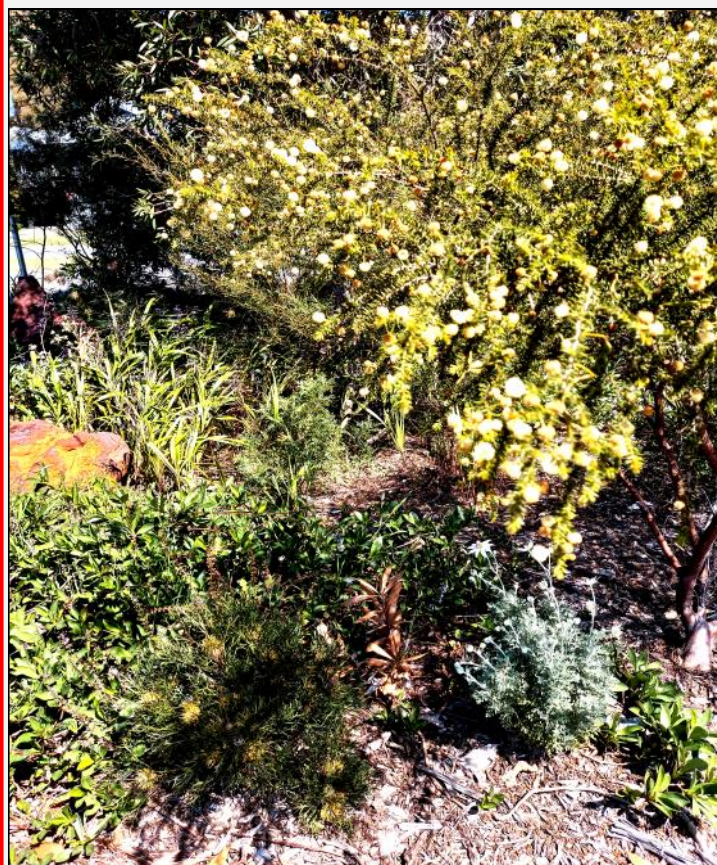
The garden in the "Square" knows it's Springtime.