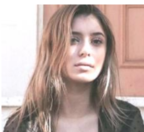
Singer/Songwriter Ebony De Luca