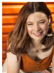
Singer/Songwriter Lucy Parle