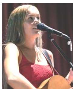
Singer/Songwriter Ella Powell